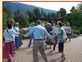
The Salmon Arm Squares get swinging in the Public Garden during the 14th Annual Classic Antique Car Show