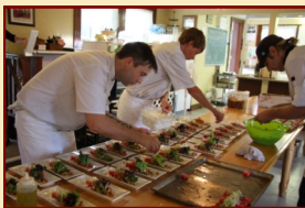
The Shuswap Chefs prepare for the First Course at the 4th Annual Soirée

If you are interested in becoming involved please let us know so that we get on with this very important initiative.