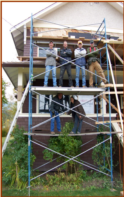
The Crew at Haney Heritage Village

This Fall I have been privileged to be given a four-person crew by the Job Creation Program. I have an excellent crew and we have many projects to complete over the slow season. We'll be doing maintenance and restoration of buildings in the Village. We have been working on the Haney House, finishing the restoration work begun earlier. We will be painting the Newnes Blacksmith Shop and chinking the log building that houses the new Dinner Theatre. We'll also be constructing a new informational kiosk and connector trail.