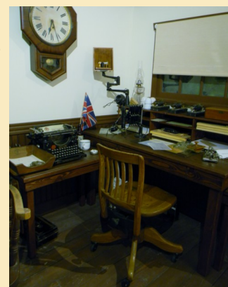
Telegrapher's desk at the Salmon Arm station