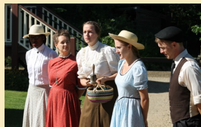
Summer students take on their Pioneer School roles

At Pioneer School, each one of these people from our rich history brings life to the Village and the stories we tell. I was lucky enough to witness this the other day when I was watching over the reception and Museum.