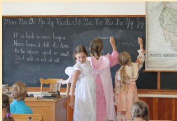
Children practice their cursive in the Broadview School