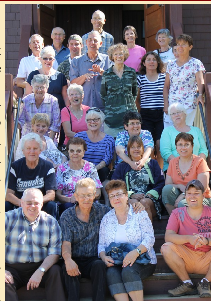
Volunteer Lunch 2014